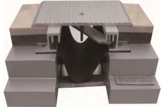
FLOOR-TO-FLOOR: KM MSD-G

The vapor barrier can be installed separately in one length upon request.