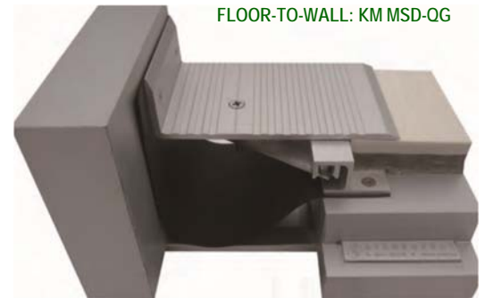
FLOOR-TO-WALL: KM MSD-OG